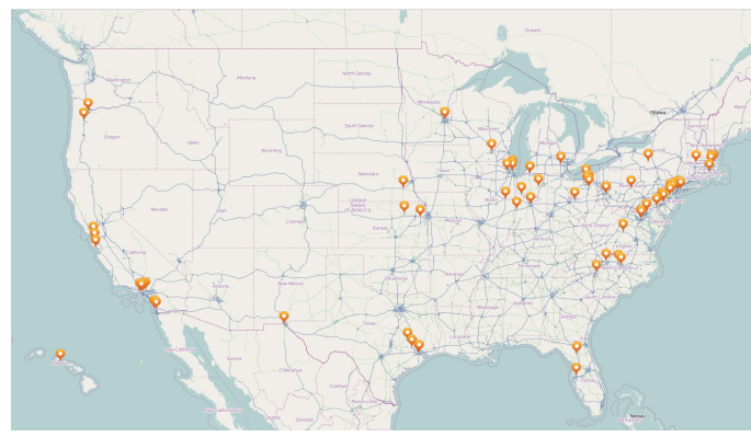
Figure 2: Home Institutions of Attendees

The summer school has been a vehicle for establishing student and faculty networks that lead to collaborations, and has helped broadened the impact of the Center by reaching students and faculty at 76 different universities in the U.S. (See Figure 2.)